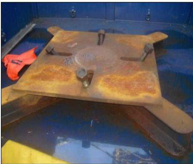
Securing plate BOP was landed on

IP suffered a small cut to their right little finger that required a visit to the medic. Medical Treatment included the application of steri-strip's and over the counter medication.